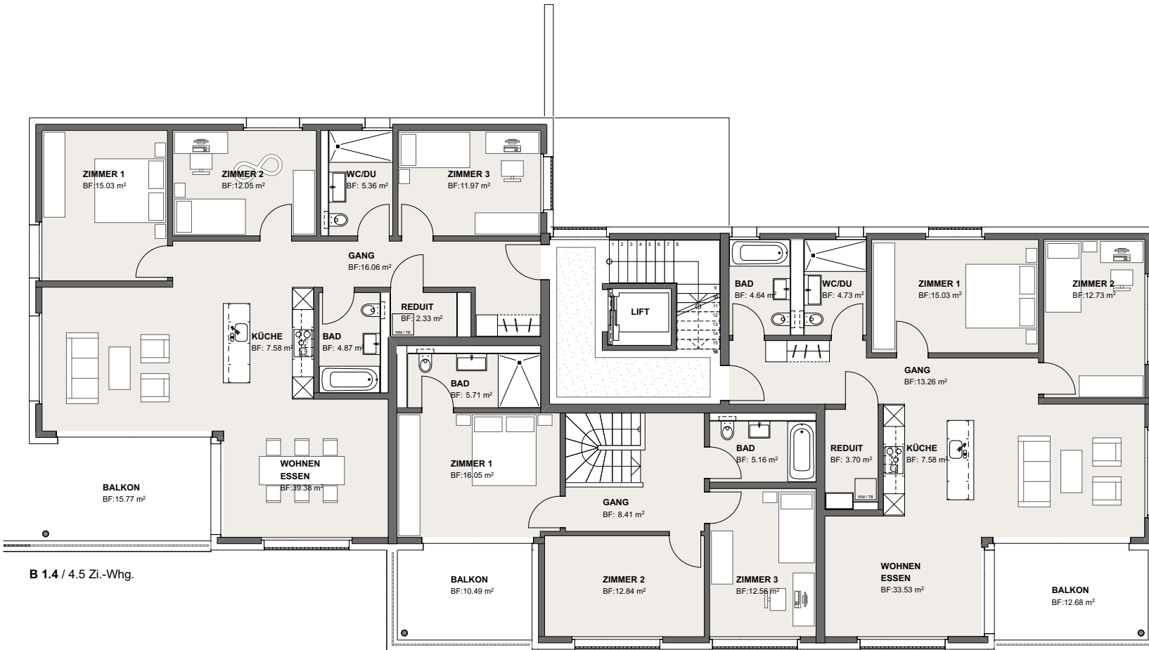
B 1.4 / 4.5 Zi.-Whg.