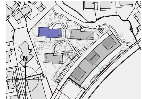
B 1.5 / 3.5 Zi.-Whg.